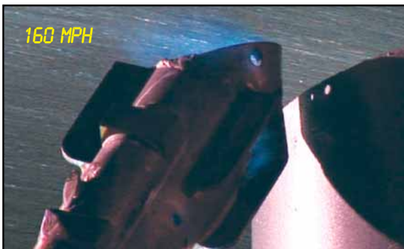
InstaFire system shown in simulated hurricane conditions.

The InstaFire system can relight a pilot within 30 seconds after pilot failure, compared to thermocouples which take much longer and waste valuable time between pilot outage and re-ignition.