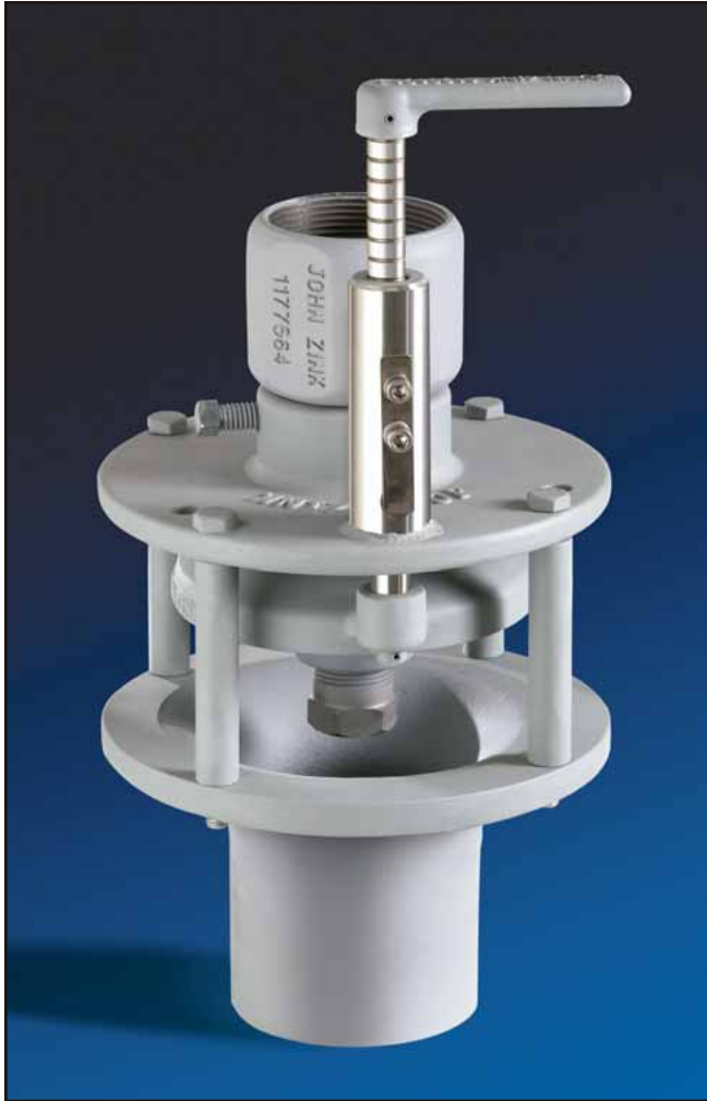
FOUR-BOLT CONFIGURATION (SHOWN AS MOUNTED)

John Zink is committed to providing comprehensive technical and business solutions to our customers' challenges. With our superior combustion design capabilities and worldwide manufacturing and service, we can help you increase output and improve efficiency while preserving the environment.