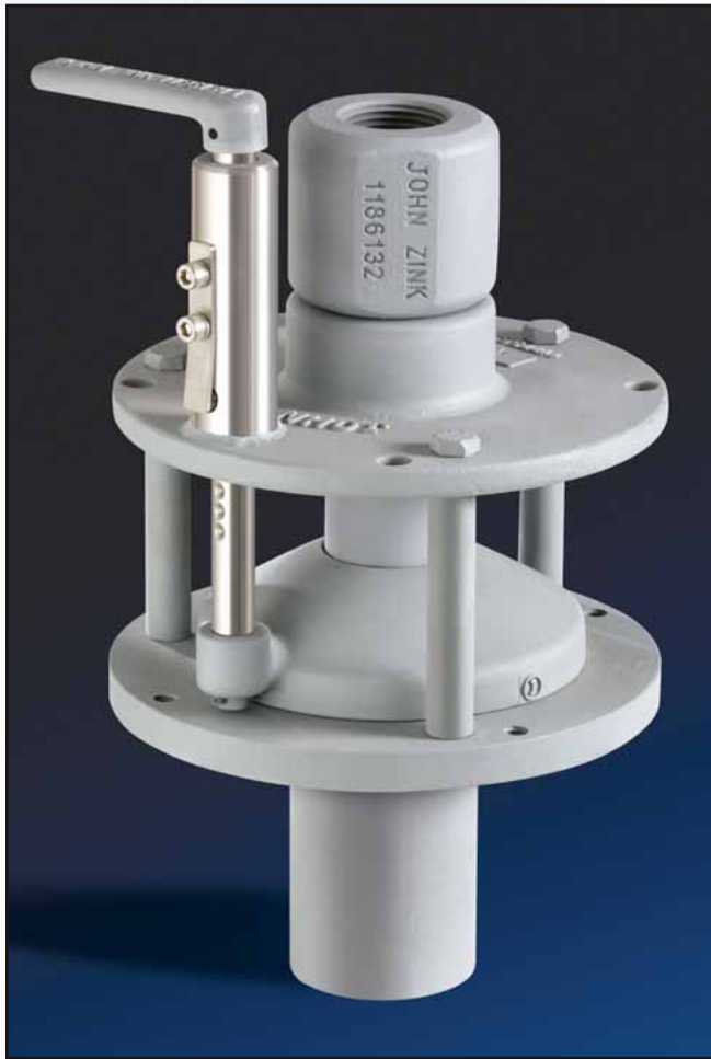
THREE-BOLT CONFIGURATION (SHOWN AS MOUNTED)

An Innovative New Primary Air Door for Premix Burners